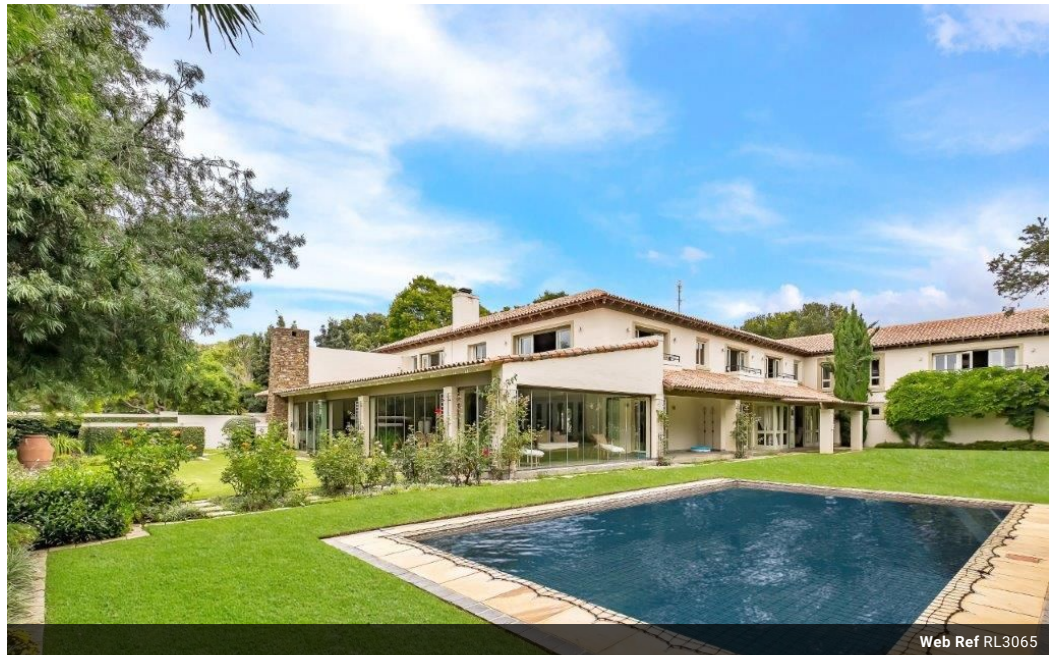
Web Ref RL3065

5 Somerset Office Park 5 Libertas Road Bryanston 2021